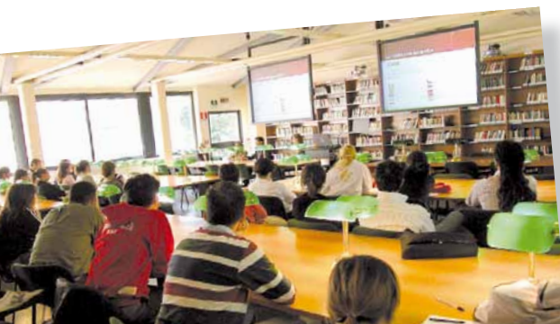
“Keynes room” of the Library of Economics